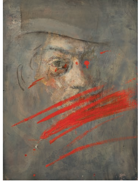
80. Pause , by Giancarlo Vitali. 1951 and 2001. Oil on panel, 39.5 by 29.5 cm. (Collection of the artist; exh. Palazzo Reale, Milan).

At face value Vitali is a realist of sorts. Deeper down, he is expressionist to the core. Keen observation, virtuoso painterliness (which suffers greatly in reproduction), grotesquerie, droll humour and death mingle in a synthesis greater than the sum of its parts. Behind his lake fish (Fig. 81) may lurk the ghosts