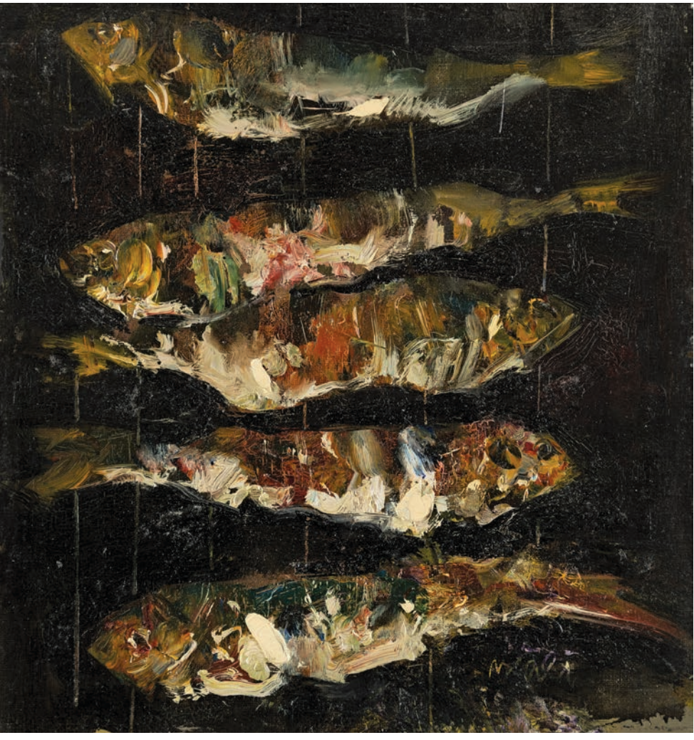
81. Shad, by Giancarlo Vitali. 2004. Canvas, 29 by 26.5 cm. (Collection of the artist; exh. Palazzo Reale, Milan).

of Courbet's Trout (1873; Musée d'Orsay, Paris), Soutine's sundry dead creatures and more besides. Yet the image holds its own against them, the energetic impasto gleaming within darkness. The same applies to his many renditions of slaughtered bulls and rabbits, while even a halved Pomegranate (1993) spills its fruity guts. Equally memorable is Pause (Fig. 80), wherein a fanciful self-portrait in a top hat fades, ghost-like, behind bloodred slashes of paint applied half a century later. Mortality and transience also run through Vitali's many treatments of blossoms and sunflowers, the last grouped together in the corner of a gallery where they hang en masse in several tiers like a bright efflorescence soon to dim.